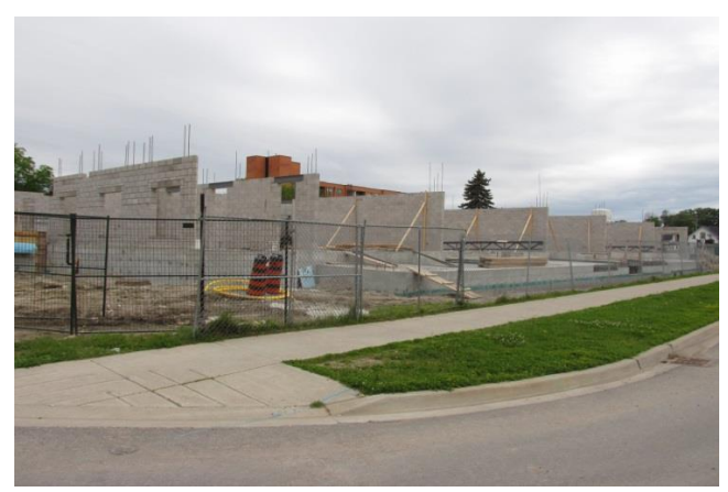
The Railway Lands under construction.

that have started construction on Victoria Street were able to get started as a result of this new policy.