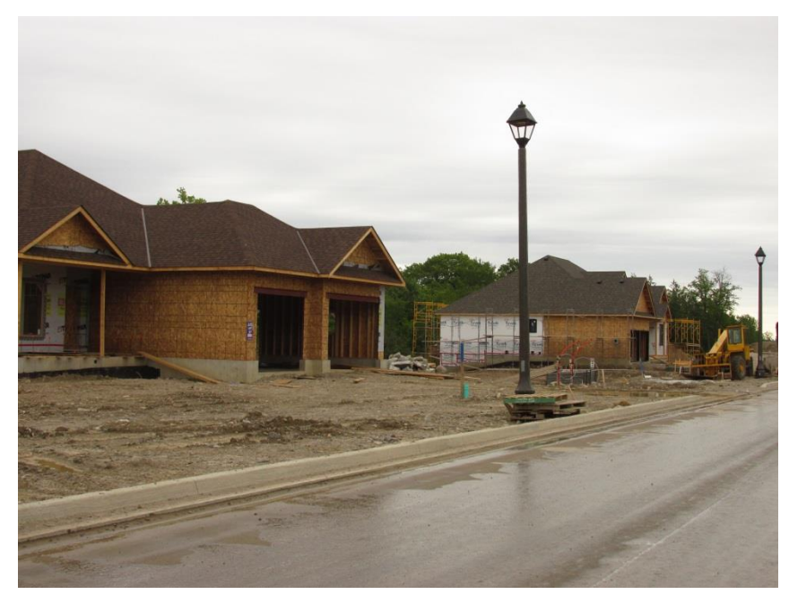
Building Permits for New Residential – By Type