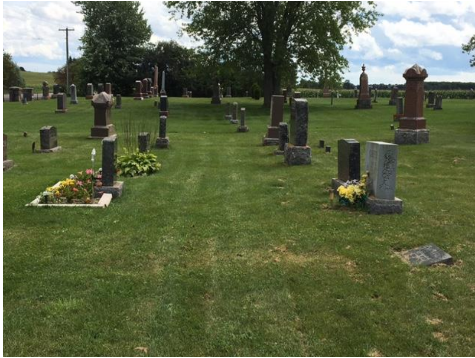
View of both cemeteries looking south, the Presbyterian site in the foreground and the United Church Cemetery in the background