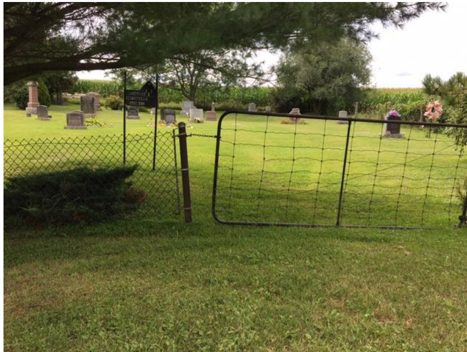
Entrance to Janetville Presbyterian Cemetery