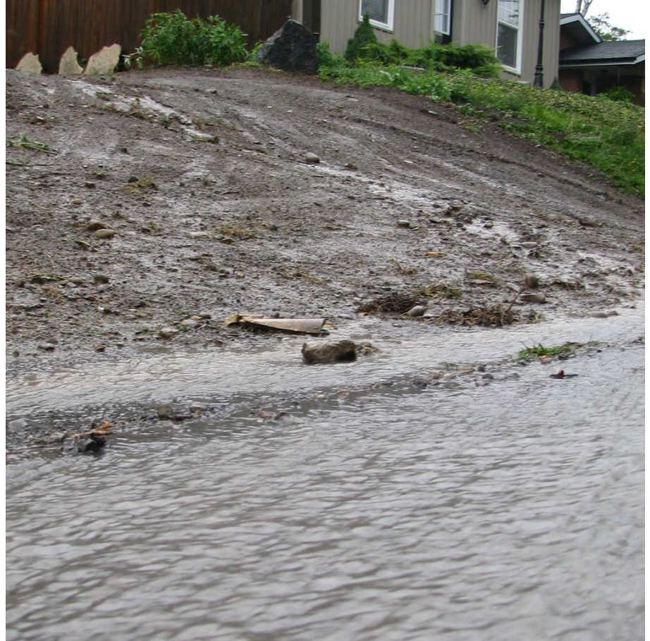
Urban Stewardship Opportunity