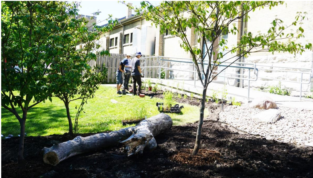
Victoria Park Rain Garden – Bluescaping Demonstration Site