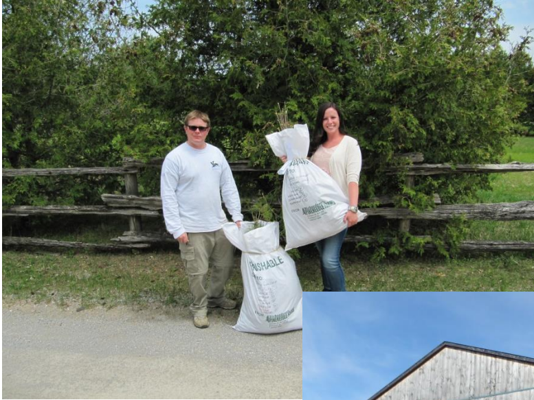
Tree Seedling Distribution