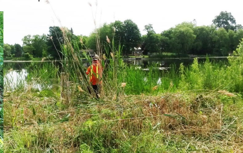
↑ Working with Kawartha Lakes staff to remove 60 sq. meters of phragmites