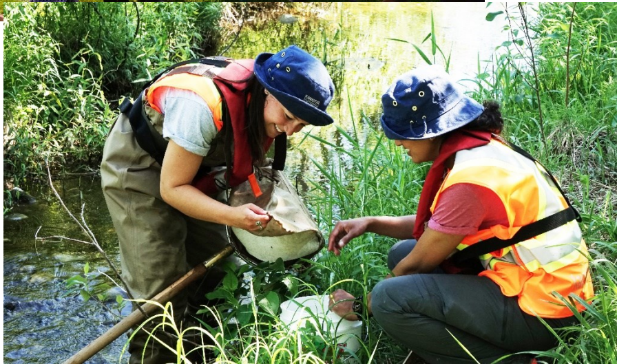
→ Staff completing water monitoring and benthic research to gain valuable insight into local water courses