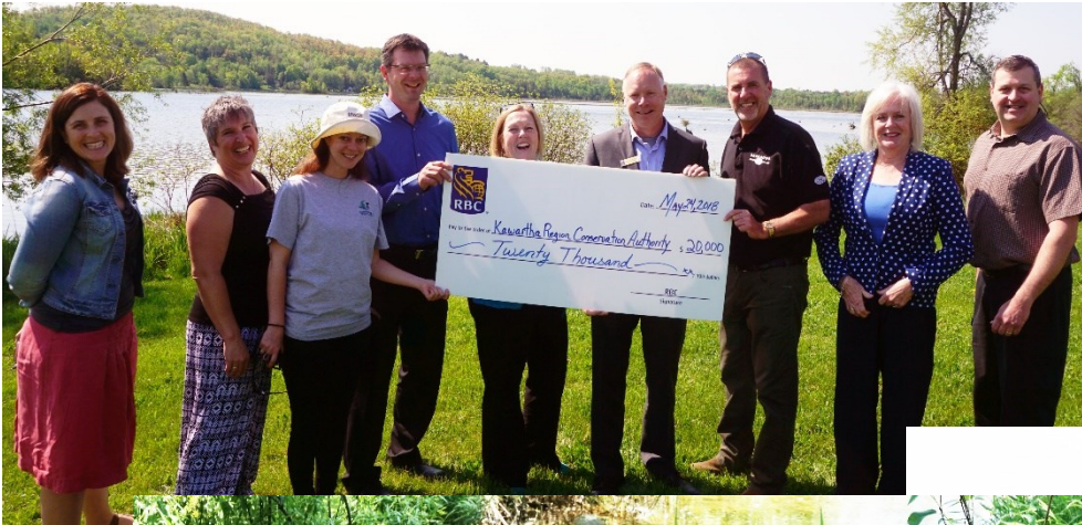
← Grant Funding announcement for the Omemee Beach.