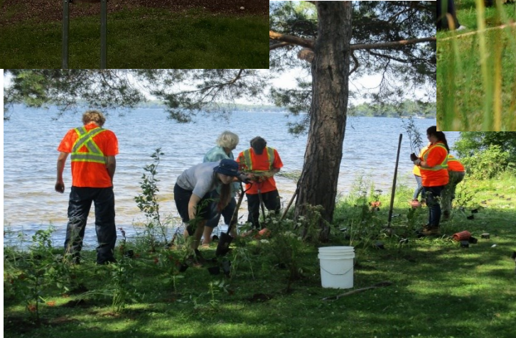
Native tree and shrub planting along shorelines