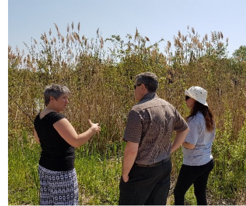
→ Working with Kawartha Lakes staff on phragmites removal plan