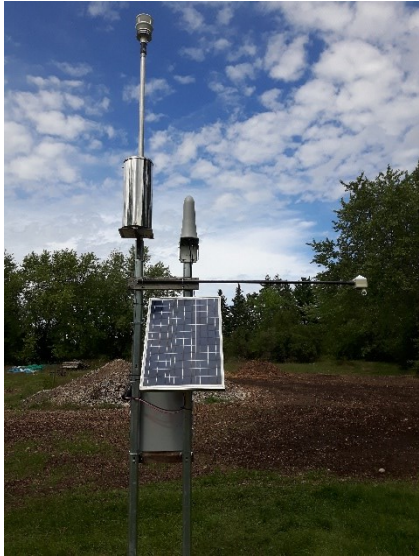
New real-time weather monitoring station constructed & installed at Emily Provincial Park