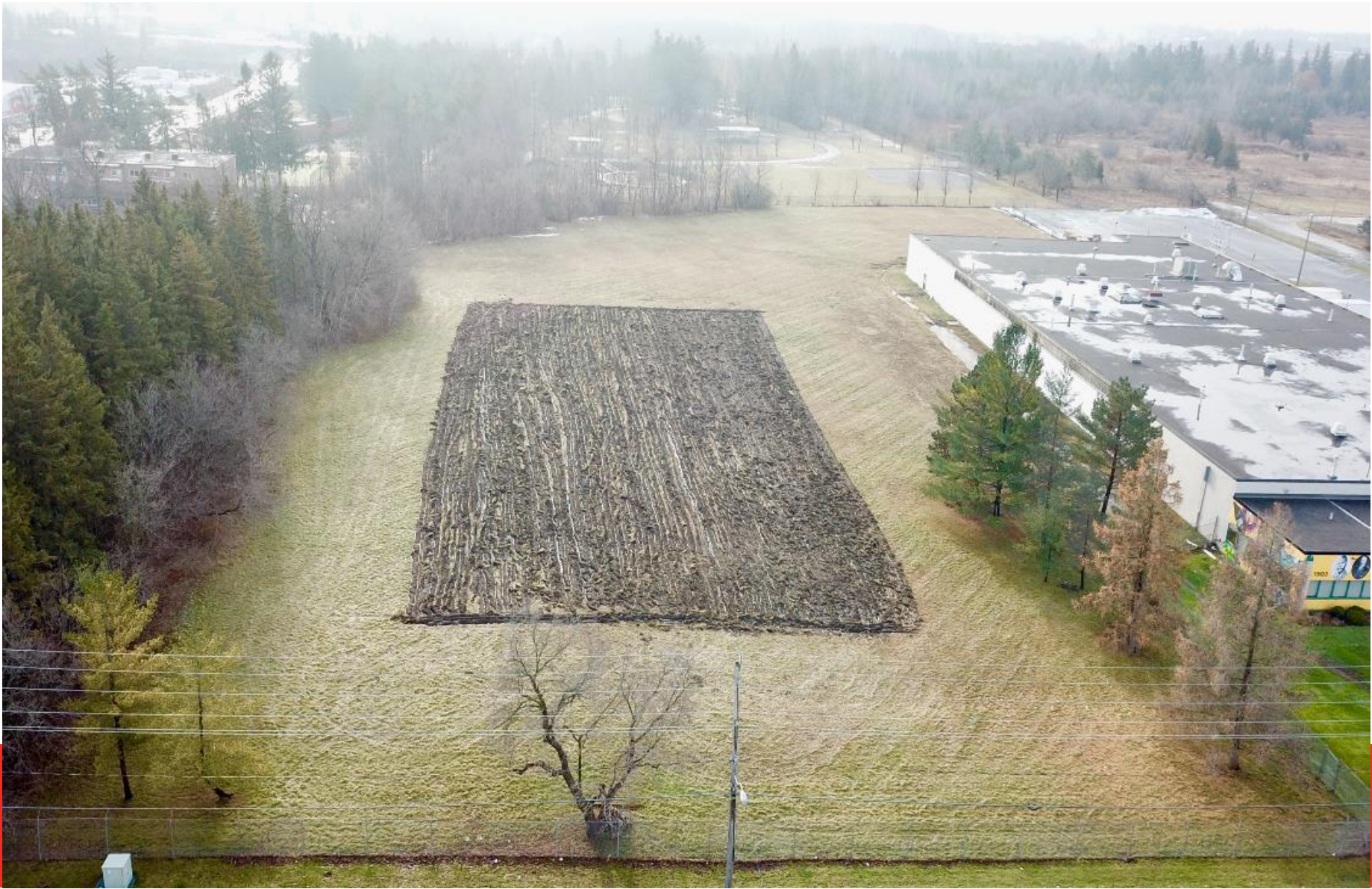
Edwin Binney's Community Garden