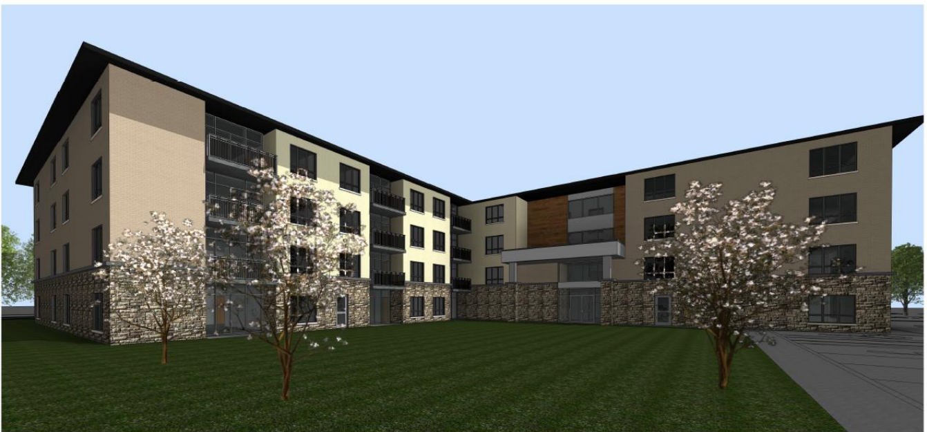
EXTERIOR PERSPECTIVE - NORTH WEST COURTYARD VIEW