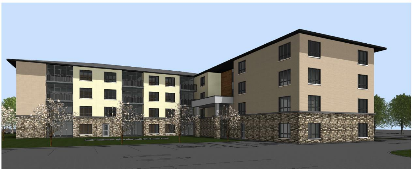
EXTERIOR PERSPECTIVE - SOUTH WEST COURTYARD VIEW