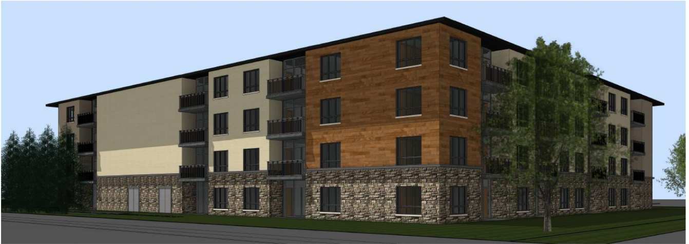
EXTERIOR PERSPECTIVE - SOUTH EAST VIEW