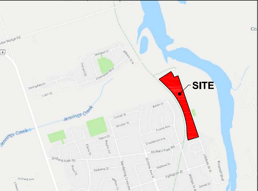
KEY PLAN-Not to Scale

PROPOSED DRAFT PLAN OF SUBDIVISION OF PART OF LOT 24 CONCESSION 5 GEOGRAPHIC TOWNSHIP OF OPS AND PART OF LOT 3, BLOCK X REGISTERED PLAN No. 1 TOWN OF LINDSAY CITY OF KAWARTHA LAKES