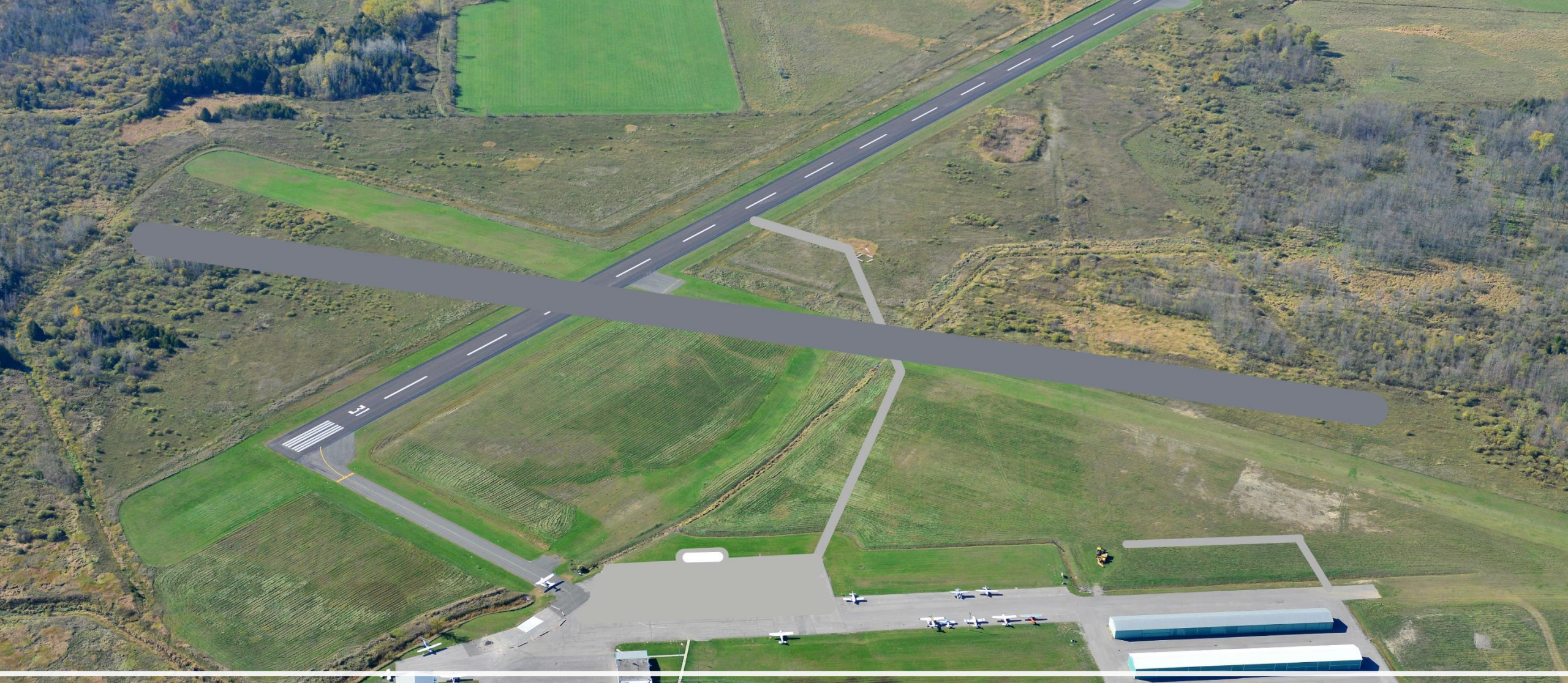
Proposed Secondary Runway