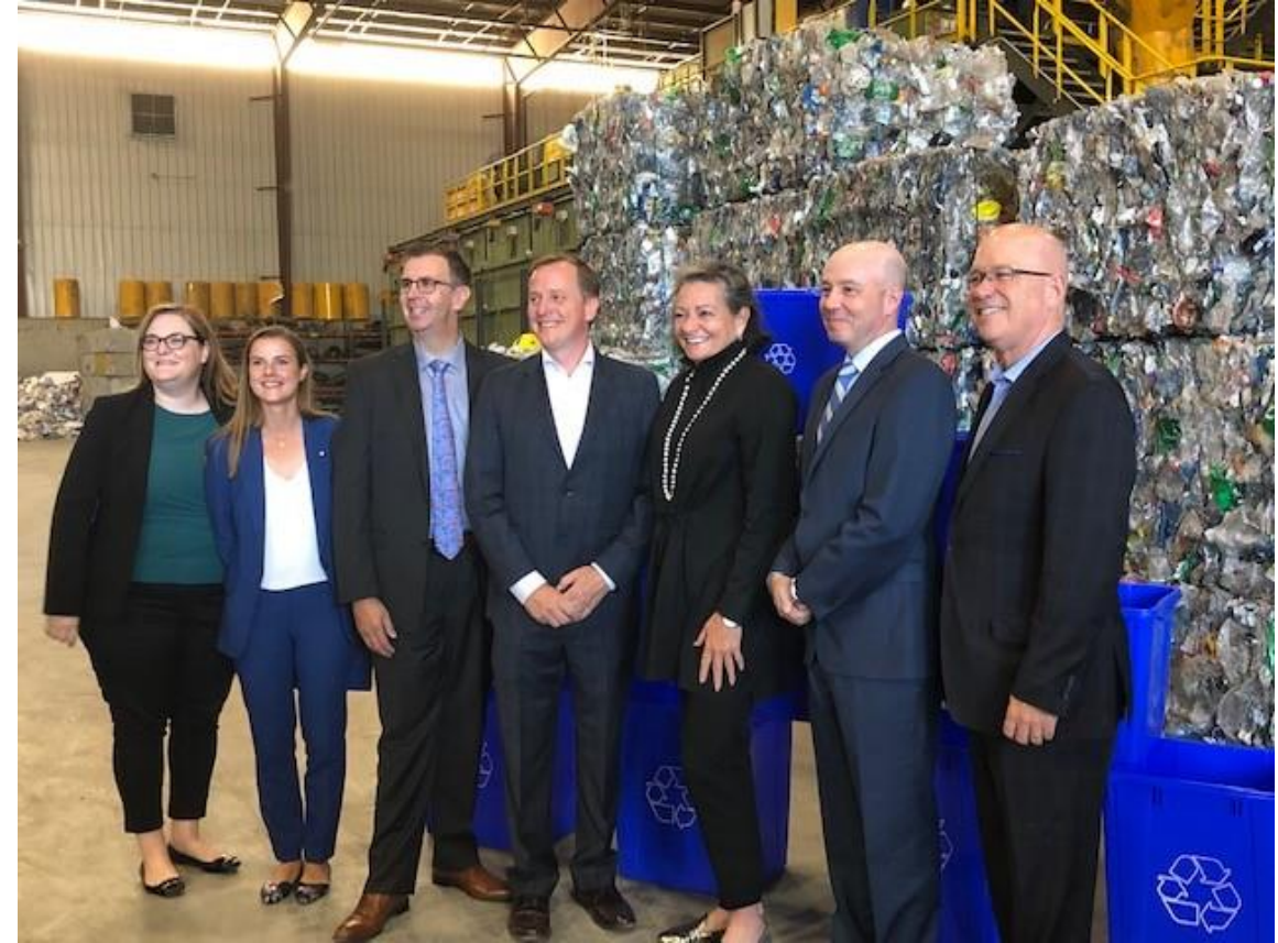
Minister's Announcement, August 15, 2019