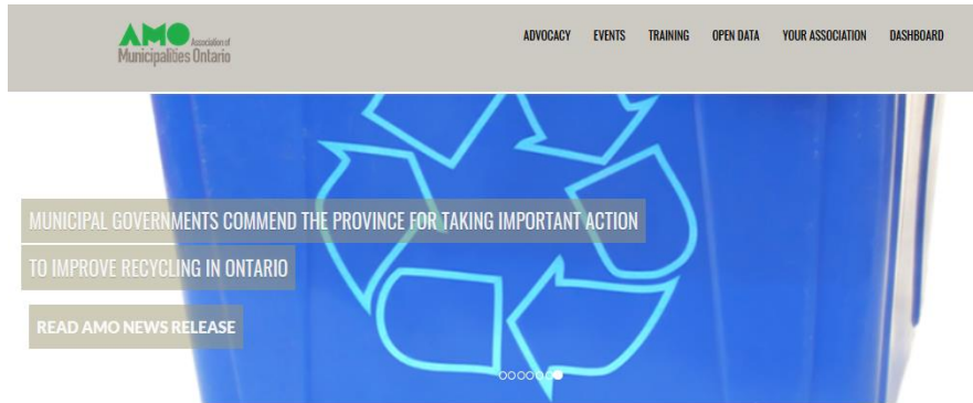
AMO Website & Portal