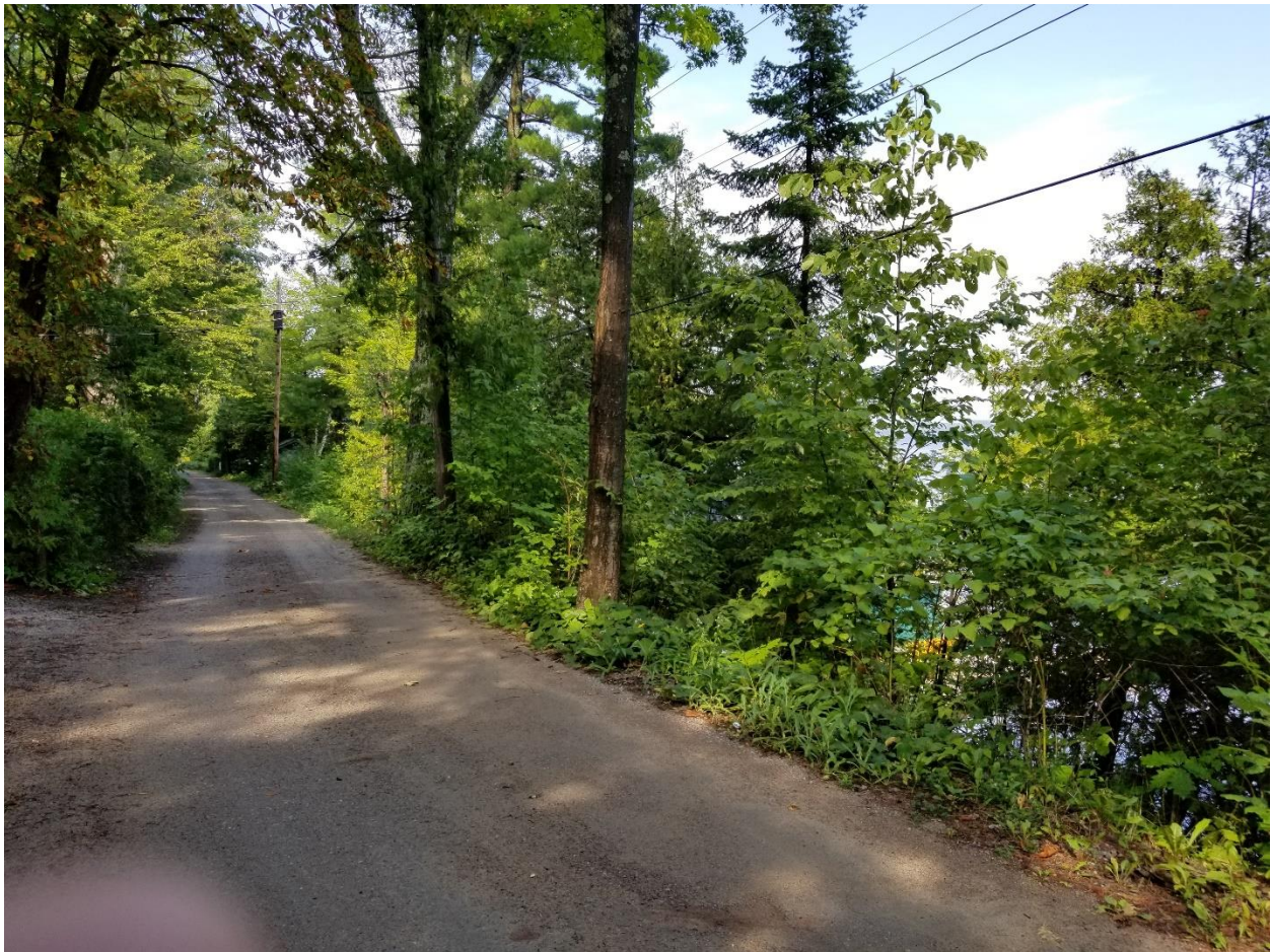
“upper” Grove Road looking westward

Except that now, 100 years later, apparently that's not good enough.