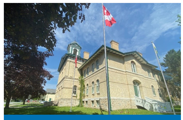
Administration closed to the public