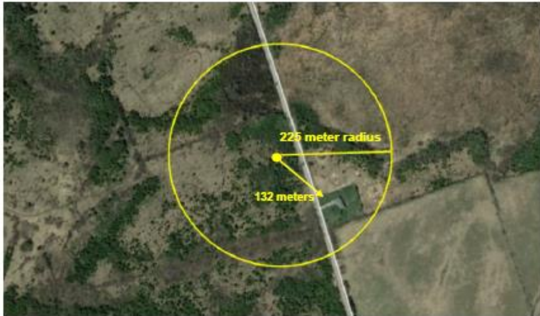
Figure 5 – Surrounding residential dwellings.