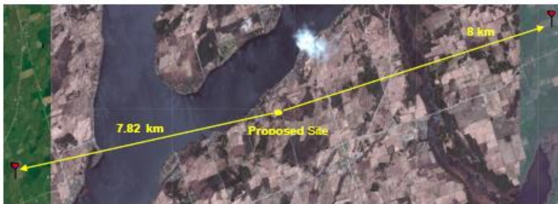
Figure 3 – Co-location Map

A survey of installations in the surrounding area in relation to our proposed site location are illustrated on an aerial shown below - (Figure 3).