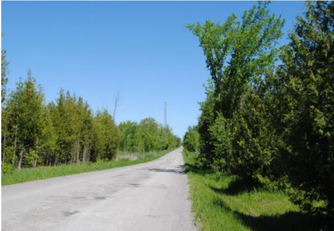
Figure 4 – Sample image of proposed installation

Please refer below for a sample of the installation for your reference (Figure 4). An additional package of viewscales is attached to this report. It simulates the view of the proposed installation from major visible intersections. The process of simulating the proposed facility into the existing conditions of each viewscape was done by superimposing an image of the proposed structure on a photograph taken for each viewscape.