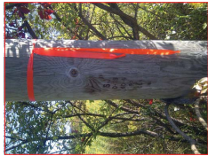
photo of utility pole