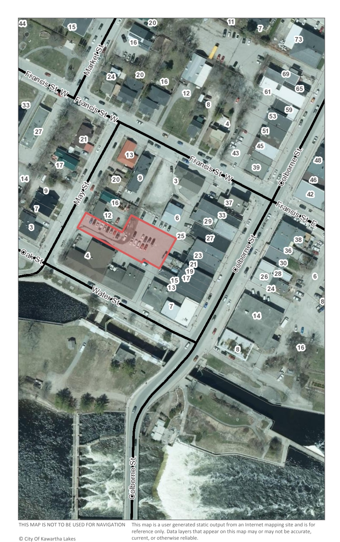
Appendix B to Report RS2021-007 File No.