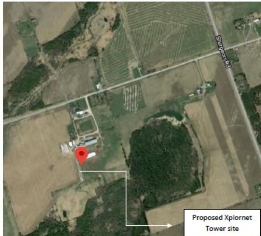
Figure 1 – Location Map (not to scale)