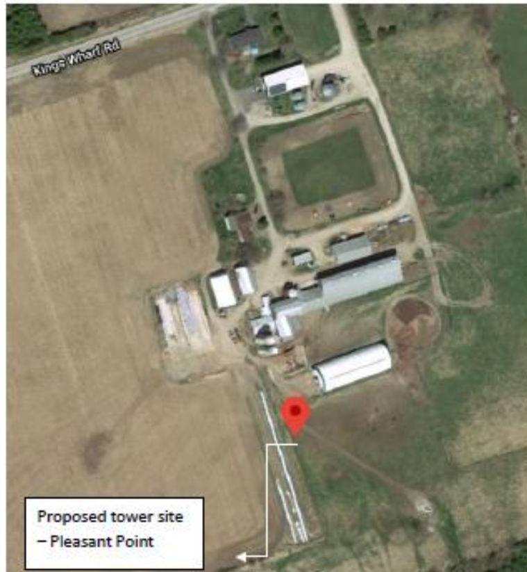
Figure 2 – Tower location on the property (not to scale)