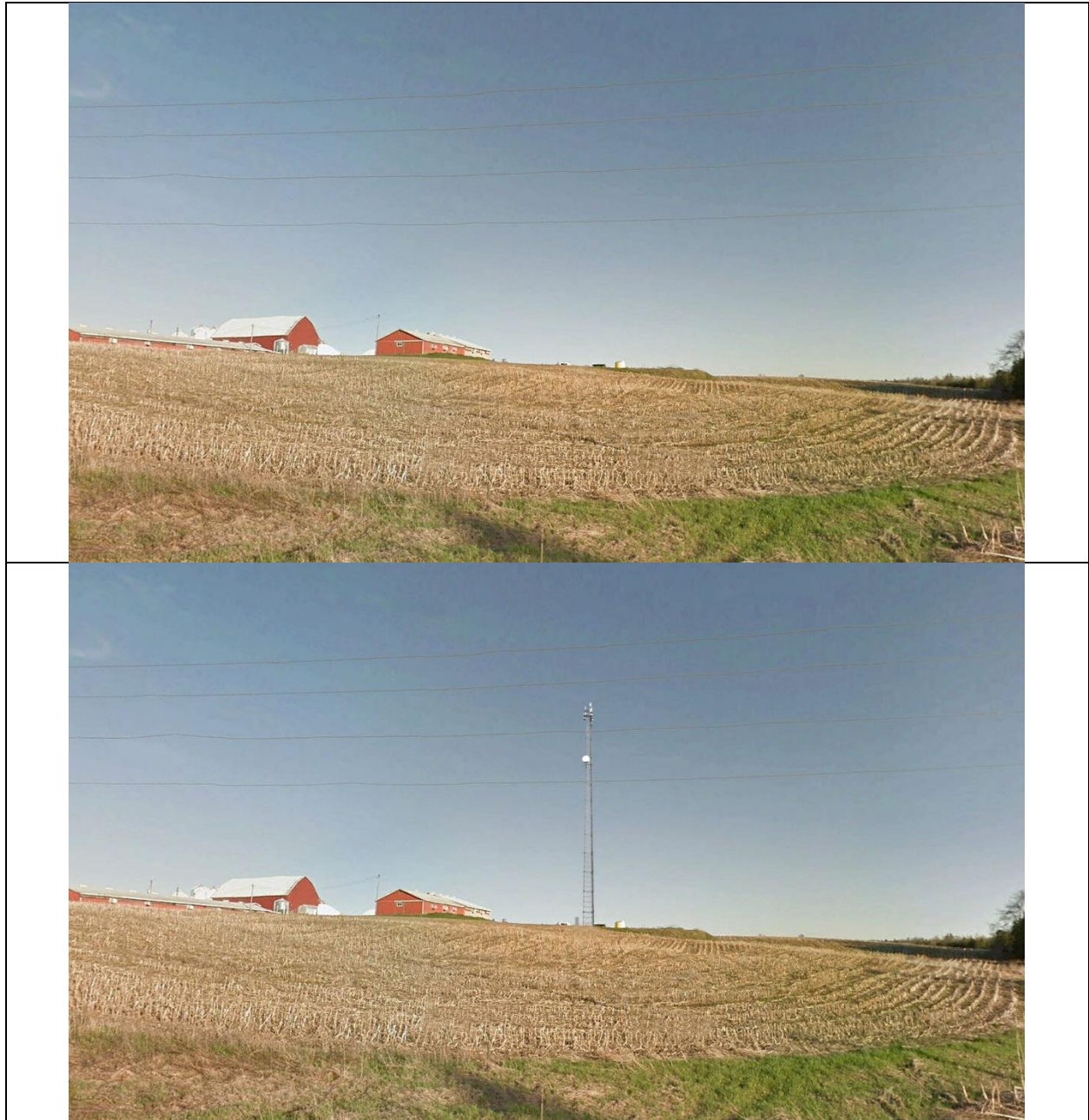
Above: Photosim of the proposed tower before and after– looking south from Hwy 7A.

The proposed installation is a lite duty self support style communications structure. The tower installation is a triangular structure and will be 45m in height and occupy a footprint of approximately 3 metres by 3 metres. The tower will have an anti-climb mechanism. Transmitting and receiving antenna equipment is mounted to the upper portion of the structure as well as provisions for future technology services.