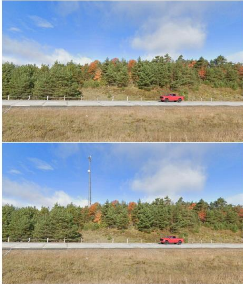
Figure 3 –Tower Elevation / Photosim (Looking South from HWY 7A)