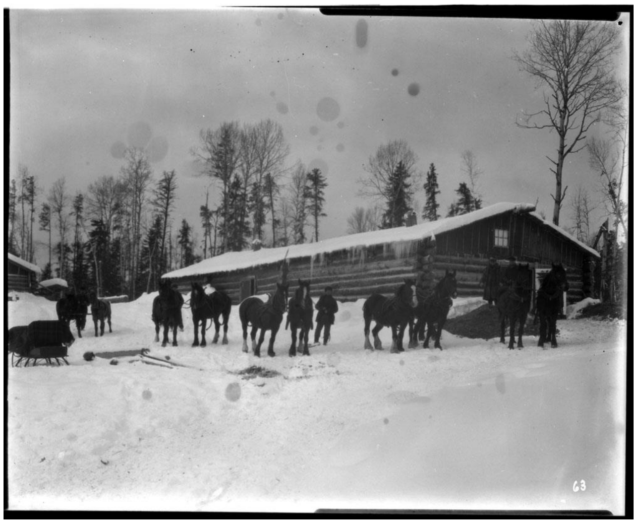
Lumber Shanty, n.d.

In these early days, timber harvesting was often a by-product of agricultural settlement. As settlers cleared their lands, they were cutting timber which they would use themselves or, depending on the amount of good timber they were cutting, would sell it locally. Similarly, sawmill owners traditionally took half of the lumber they cut as payment and this lumber was sold, both within local communities and slightly further afield. Mills were oriented to the needs of the local market, and were not equipped to as major businesses or exporters.