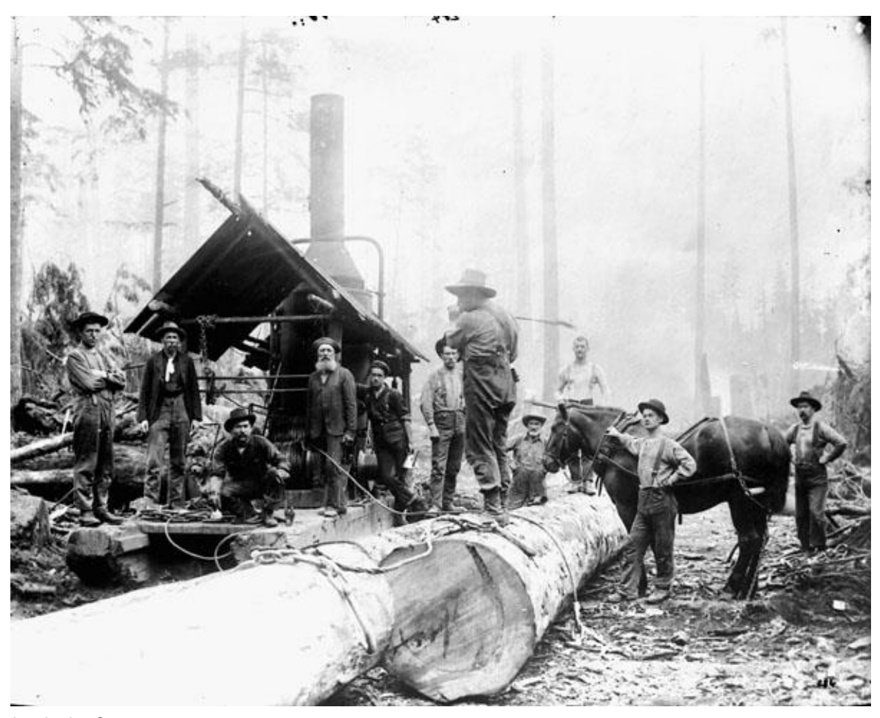
Lumbering Scene c.1917

cut lumber from their own farms and sold it directly to mills or who cut lumber in the winter in lumber camps before returning to their farms in the spring. However, as the industry grew, this small scale model was no longer sustainable, and larger, more organized operations took the place of local, family affairs. By the second half of the century, the industry was dominated by a handful of larger companies which organized the cutting, transport and sale of the timber and employed larger numbers of men throughout the process. The consolidation of the industry also included the regularization of its bureaucratic side, with lumber companies now required to purchase land or timber rights in order to log; new regulations regarding licensing made it more difficult for individuals and smaller operations to participate in the industry.