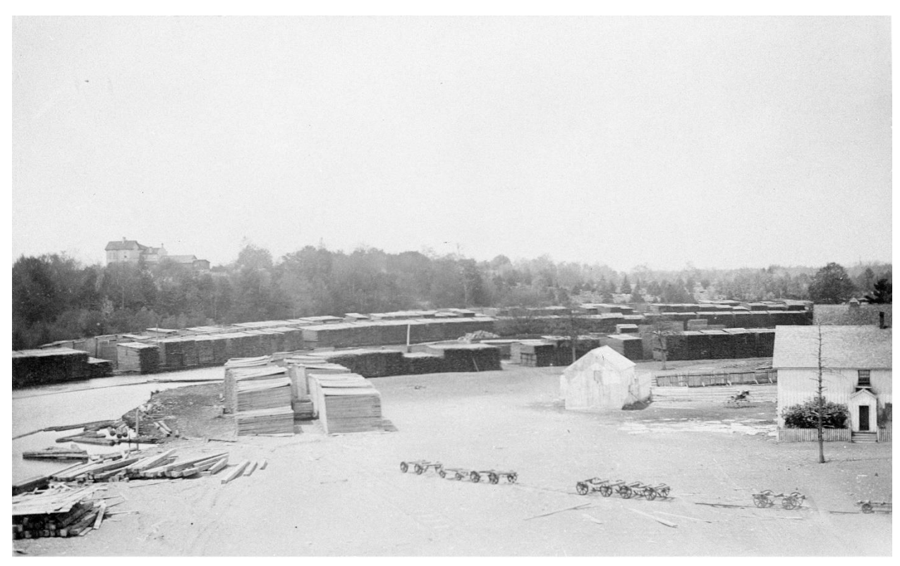
Boyd Lumber Yards

movement of men, horses, supplies and the timbers themselves. The operation also included the canal between the Black River and Lake St. John and the tramway between Lake St. John and Lake Couchiching which were major construction endeavours. This was typical of the infrastructure required to harvest and process lumber but on a much larger scale than other operators, likely rivaled only by Boyd within Victoria County. The industry could only operate because of these huge and sprawling networks of infrastructure to facilitate the harvesting, transport and processing of lumber and came to include shanties, supply depots, dams and canal works, trains, and the mills themselves, all directly supporting the timber harvest.