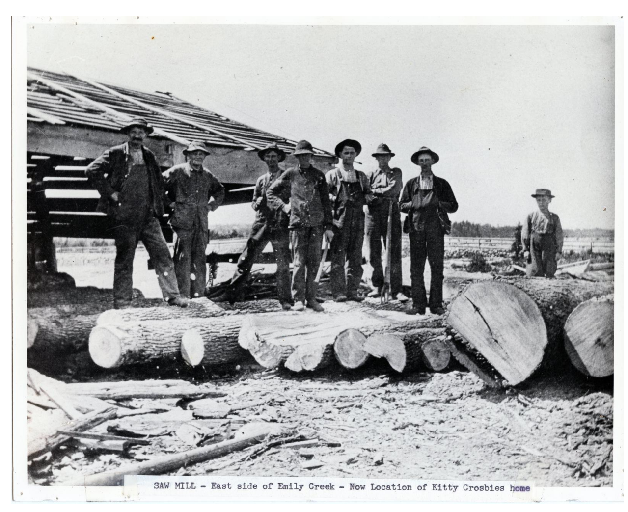
Sawmill at Emily Creek

censuses, due primarily from an exodus from agricultural properties; although Ontario as a whole was experiencing a decline in its rural population at this time, the percentage decrease for the rural areas of the province as a whole was only 4.2% indicating the hardships that the shifting economy in the region brought to its local inhabitants. Howe and White estimated that nearly 200 farms in the region were subject to tax sales at the time when the report was written due in large part to the interconnectedness between successful agricultural settlement and logging, and the decline of the latter.