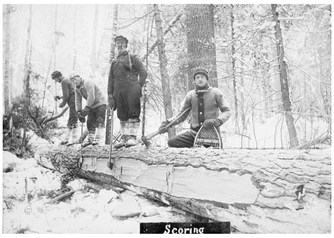
Lumbering Scene, n.d.

The most direct beneficiaries from the lumber industry were sawmill owners and operators whose output, business and profits increased alongside the extraction of lumber from the forest. Small sawmills which in their earliest days had served only the local settler population for their own use gradually took on additional lumber for the export market, particularly with the shift from squared timber to sawn lumber in the 1870s. While some mills, such as those owned by Boyd and Thomson, were part of a fully integrated business model, others were standalone operations which purchased their wood from other companies. This included mills both in close proximity to the harvest areas and in other communities, such as Lindsay, where several large mill operations had opened by the late nineteenth century and were supplying vast amounts of lumber to local and external markets. Generally, smaller local mills supplied the local markets while some of the major village mills transitioned into significant industrial operations to supply the export market. By this period, the lumber industry – including extraction, processing, and transport – was the primary direct employer in many communities in Kawartha Lakes, particularly in the northern townships. It should be noted, however, that many of the lumberjacks themselves were not necessarily local to the area as many companies, including Mossom Boyd, brought in their own workers who were experienced and skilled in the timber harvest.