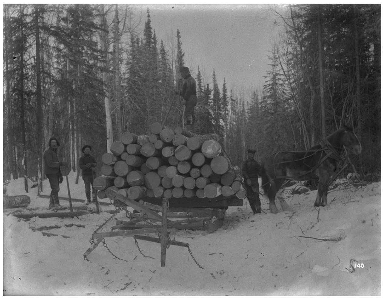
Lumbering Scene c.1917

were involved in the production of dressed or sawn lumber for the domestic and American markets and owned large sawmills in a variety of communities across Ontario.