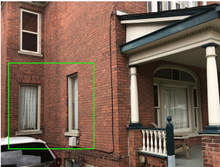
North and east facing

We wish to upgrade the above windows with a retrofit install that maintains the windows' current appearance and aligns with the existing colour scheme of the house. The house faces north. Three of the windows are visible from the street: