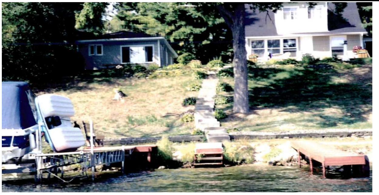
Photo of Dock 27, taken on June 5<sup>th</sup>, 2020, after the Maintenance and Liability Agreement was put into place (June 1<sup>st</sup>, 2018):