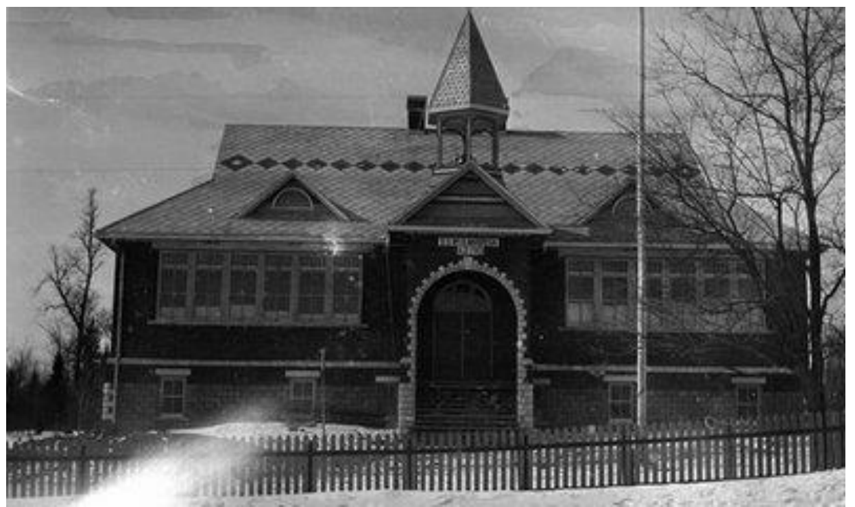
1914 Mariposa S.S. 8 School