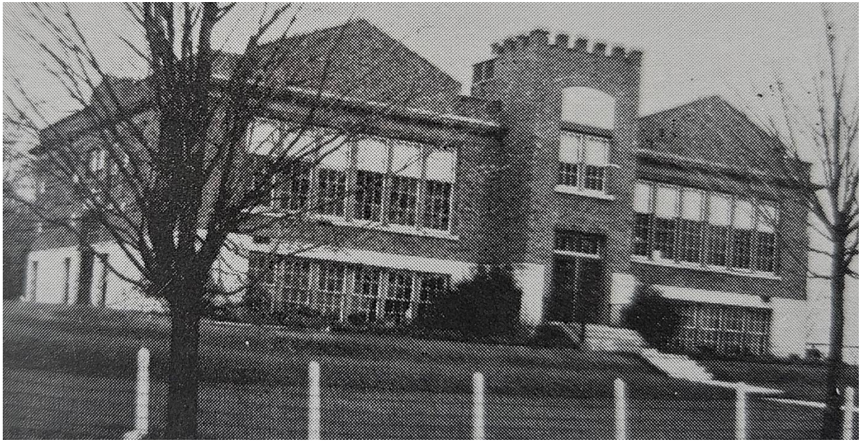
1929 Public and Continuation School