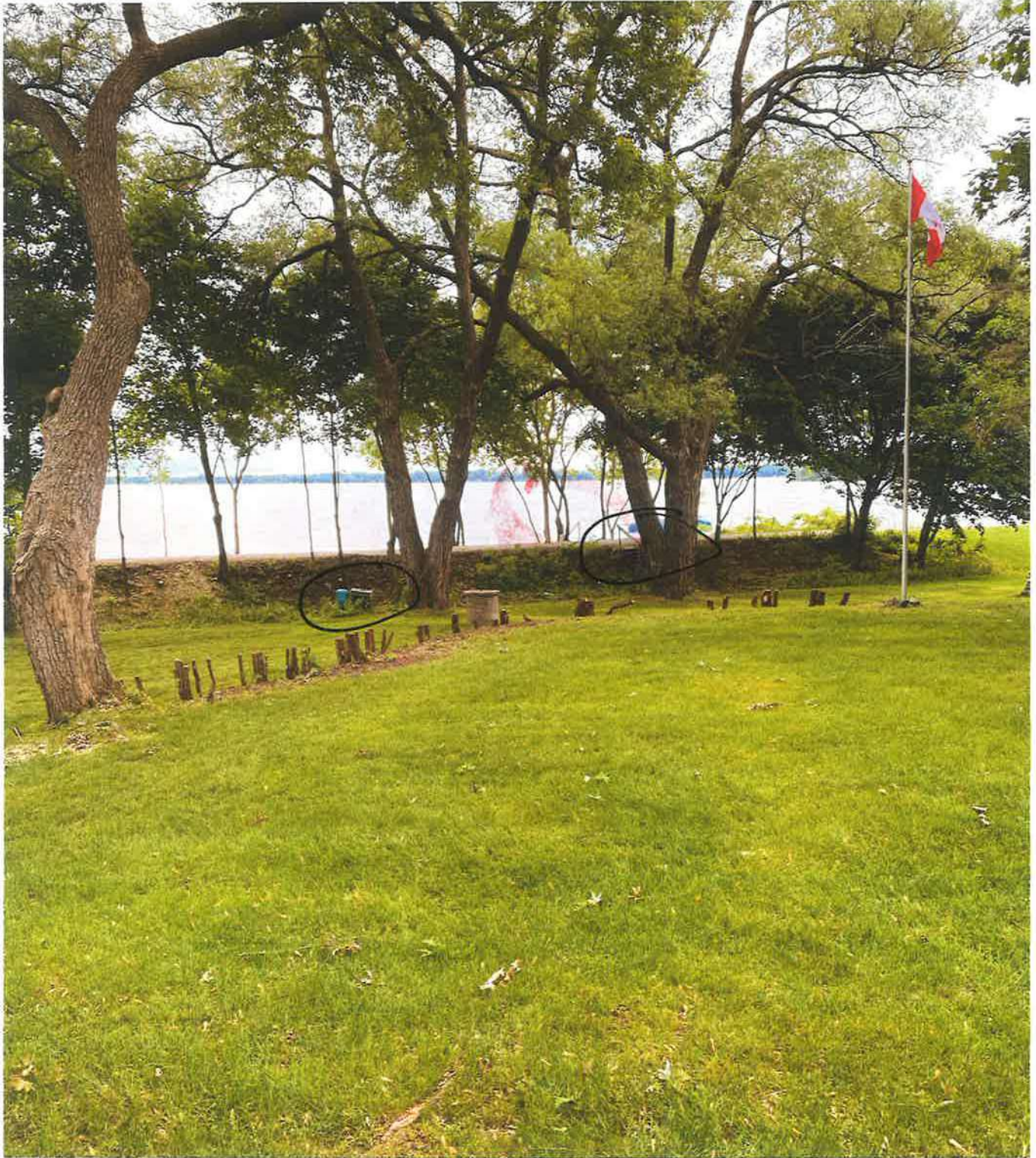
Irrigation Pump & stairs created upon purchase.