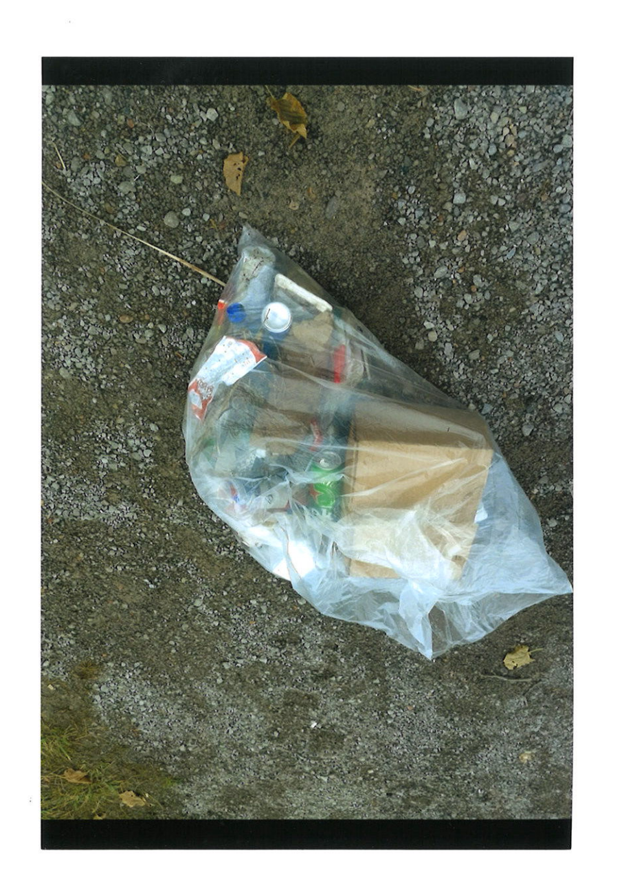
Bay of garbaye collected at Frankhill