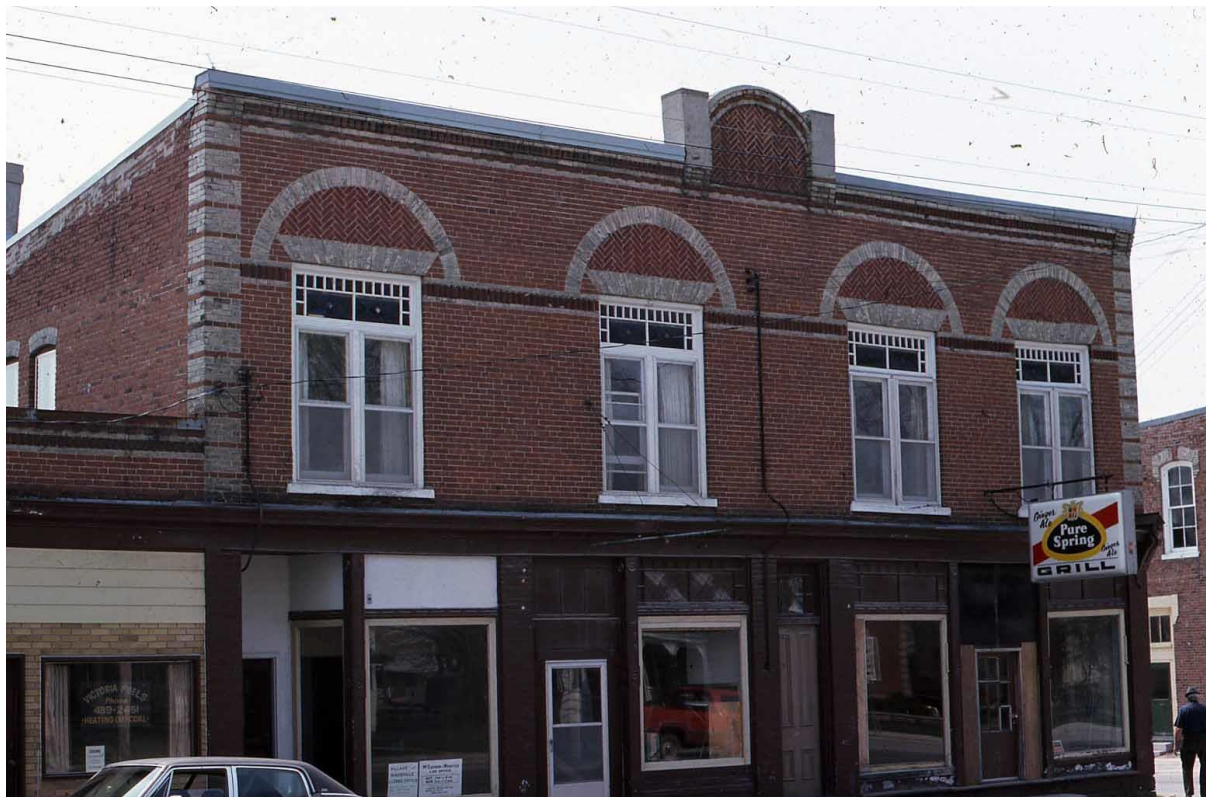
97 King Street, 1977