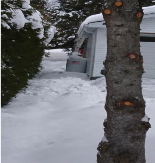
A typical winter

With the larger driveway the area for snow storage has been reduced. During the winter months, it appears the snow is being shovelled downstream of the drainage ditch / culvert, thus possibly impeding the drainage.