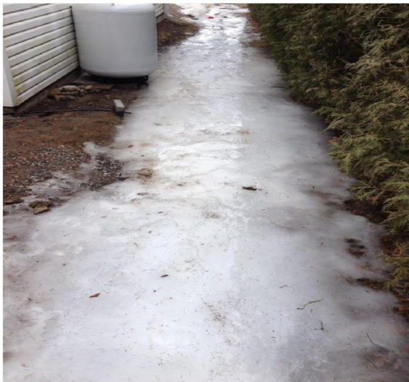
The thaw and freeze

2. Raising or relocating the garage propane tank adjacent to the Ditch.