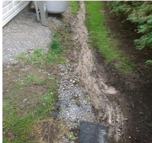
Summer Erosion after a typical rain storm

The pictures above were provided to Council by the owner of 149 Fenelon Drive at the March 5 th , 2024 Committee of the Whole meeting.