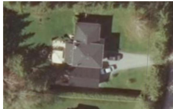
Driveway prior to widening