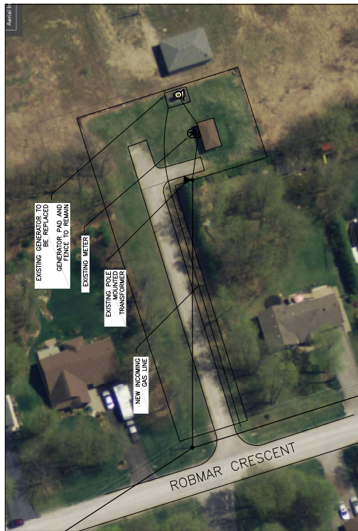
SITE PLAN SCALE: NTS