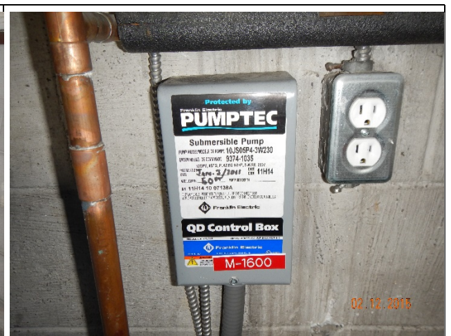
Water pump control unit