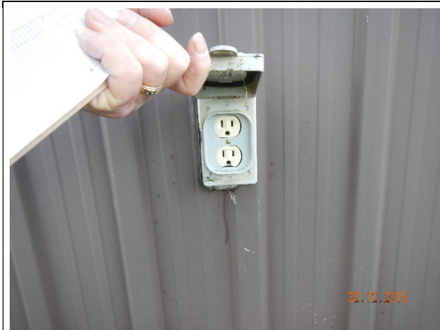
Exterior vertical prefinished metal cladding

The exterior cladding is prefinished sheet-metal cladding. The prefinished metal cladding is generally in good condition. No significant signs of deterioration were present. No issues were reported by the site representative. This item is not anticipated for repairs or replacement during the study period. Minor repairs if any are considered under normal operations and maintenance.