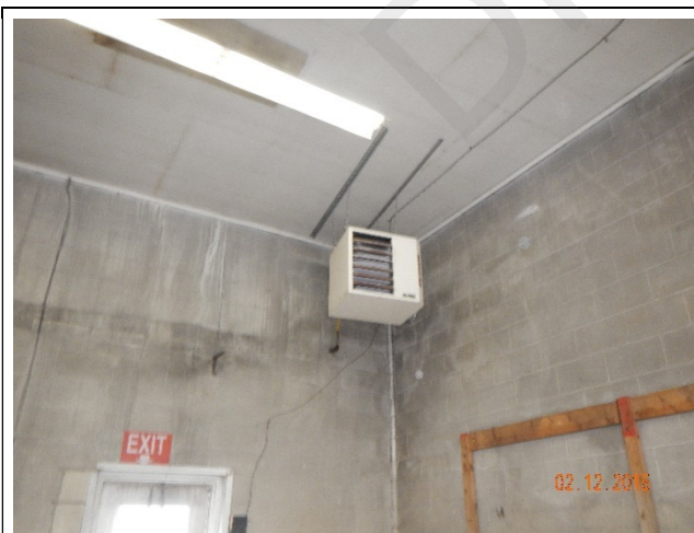
Ceiling mounted propane heating unit