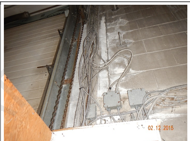
Interior concrete block wall