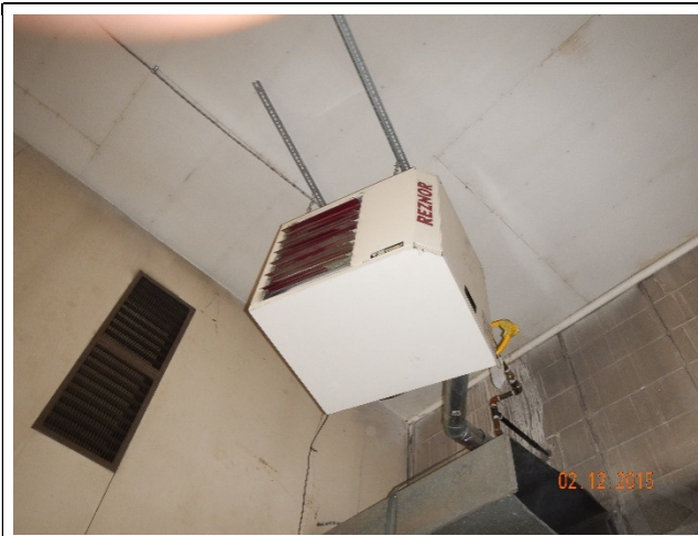
Ceiling mounted propane heating unit

Heating for the depot area is provided by two ceiling mounted propane unit heaters. Heating for the office washroom and lunchroom area is provided by a high-efficiency propane forced air furnace. The heaters appear to be in good condition. We have included a budget to replace the unit heaters and the furnace within the term of this report. An allowance is carried.