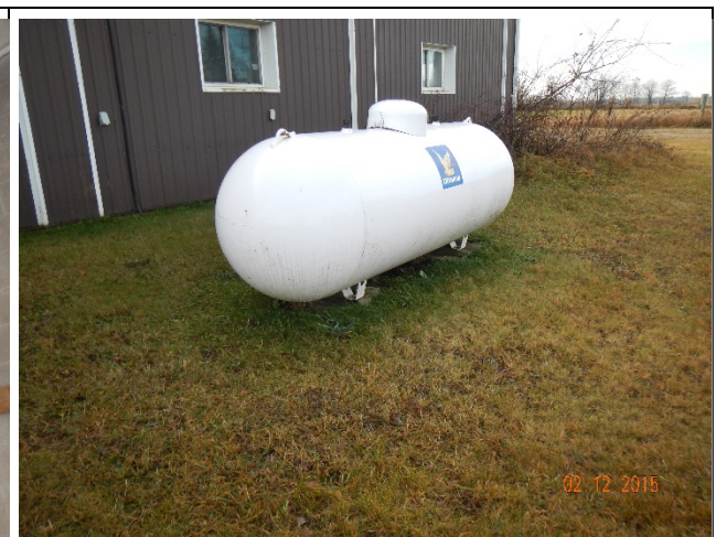
Propane tank on the north side of the building