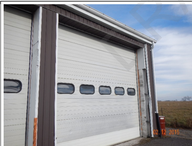
Overhead roller doors

The exterior doors consist of three overhead roller doors at the front of the building with two metal service doors both having a glass panel insert. The overhead doors are manually operated. No significant signs of deterioration were present. No issues were reported by the site representative. This item is not anticipated for replacement during the study period.