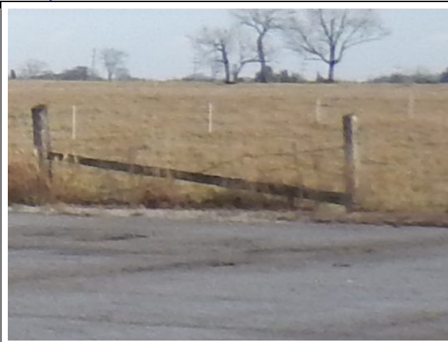
3-foot farm fence surrounding the complex