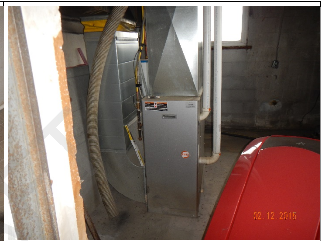
High-efficiency forced air propane furnace