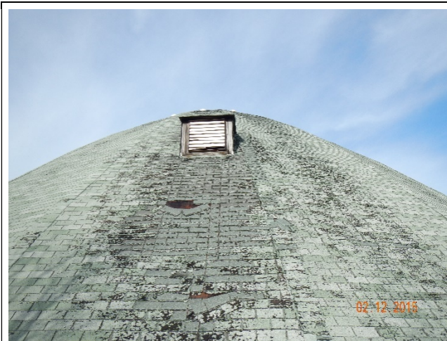
Salt dome shingle damage

The roof on the salt dome is an asphalt multi-tab shingle type roof. This roof is in extremely poor condition and needs to be replaced immediately. This component is anticipated for repair or replacement during the study period. An allowance is carried.