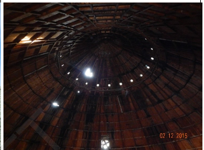
Damage inside of salt dome