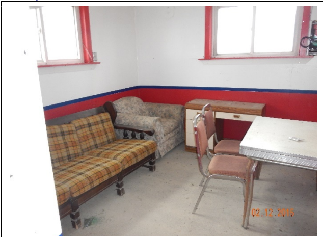
View of slab on grade floor