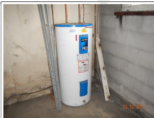
Electric hot water tank

The domestic hot water for the building is generated by one "JOHN WOOD" 184L electric hot water tank. (At the time of our inspection the system was winterized). Based on our assessment and discussion with building representative, the system is working satisfactorily and no issue identified. We anticipate the system can be upgraded on an as needed basis at a cost below the threshold of this report. No allowance is carried.