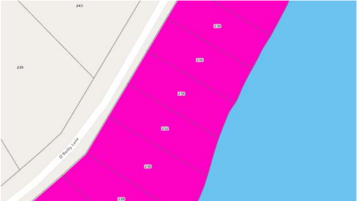
Section 20. Waterfront Designation