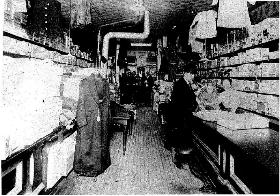
McPherson's General Store, interior, n.d.