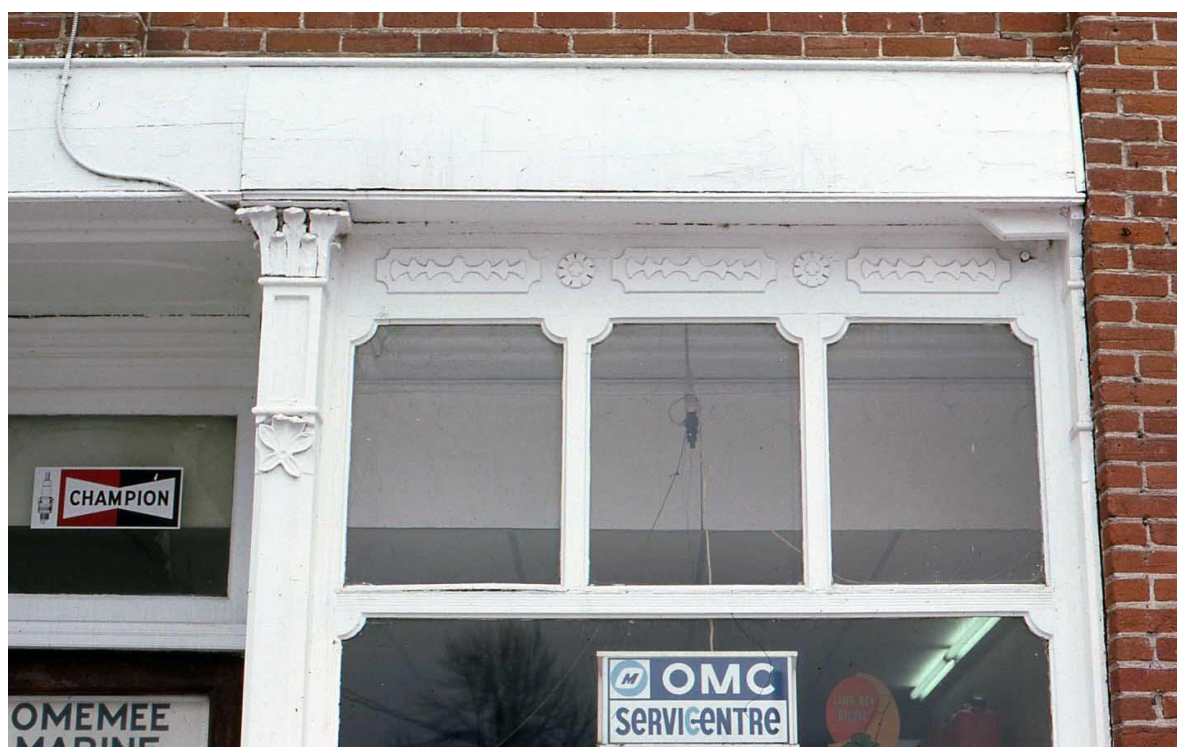
Cast iron storefront details, c. 1977