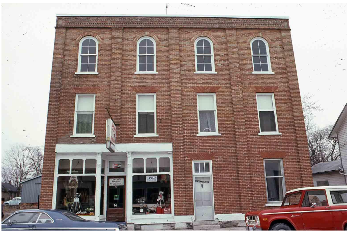
34-36 King Street East, c.1977