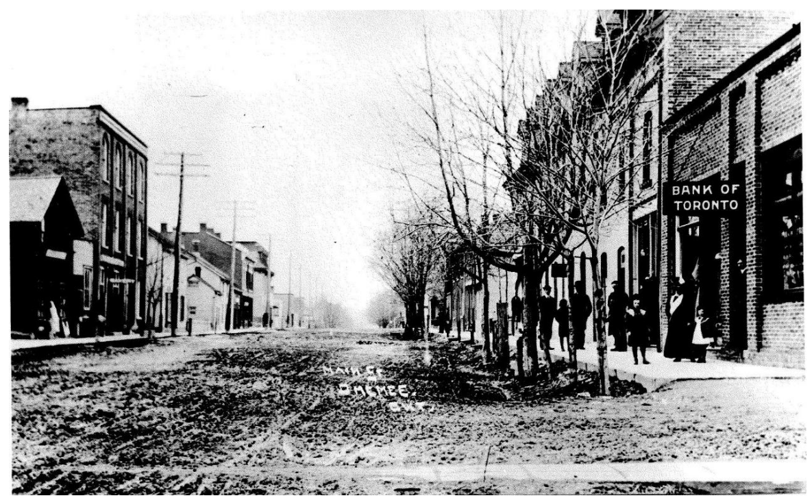
Downtown Omemee, c. 1906