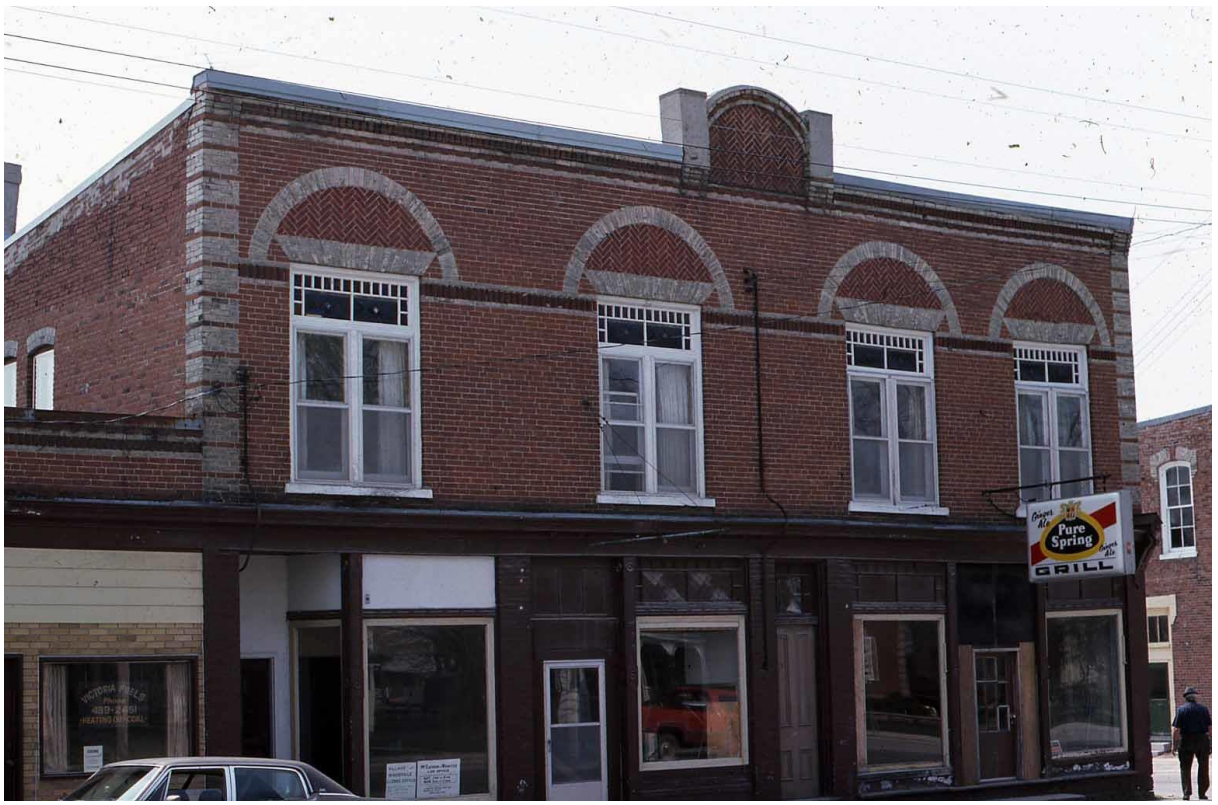
97 King Street, 1977